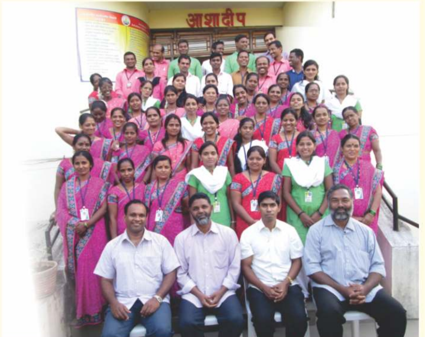
Staff Gathering - Dec. 2014