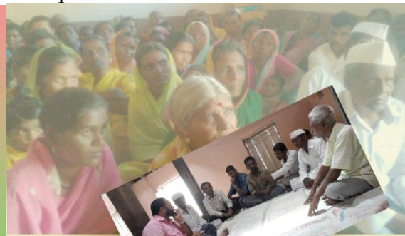
Focus Group Discussion