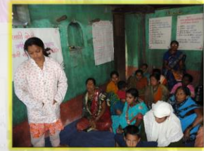
Training of the pregnant women