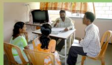
Base Line Survey Study