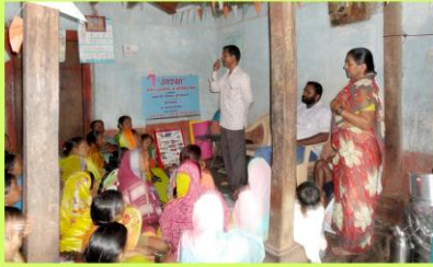
Analysis of Livelihood